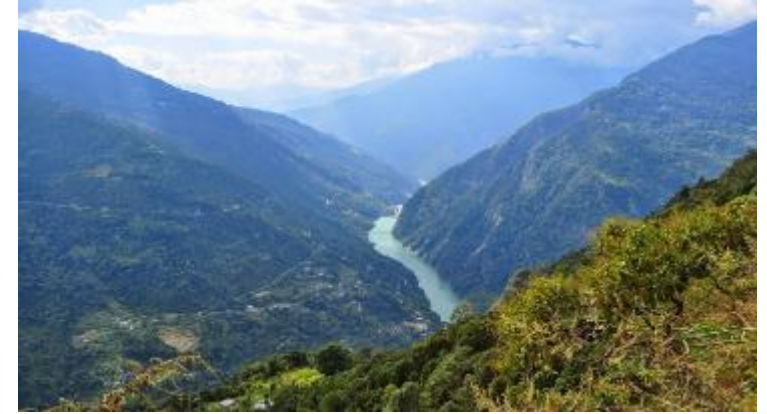
Singhik View Point