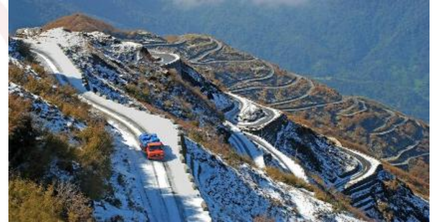
Lachung – Gangtok Roads